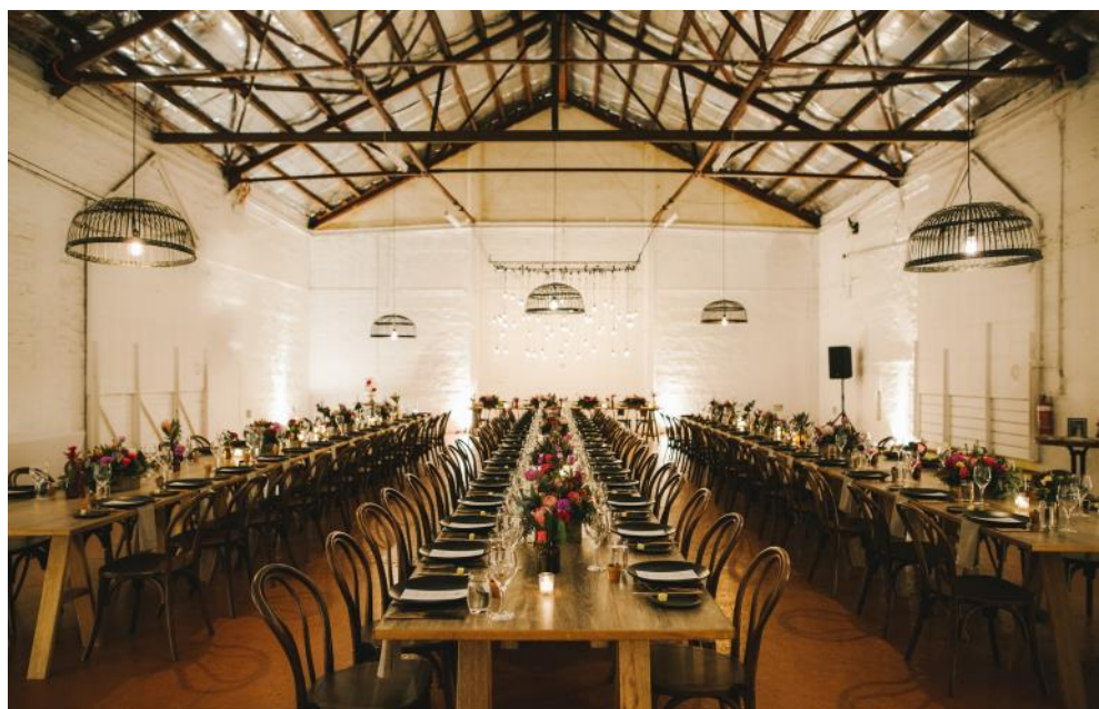
The Barn, Kitchen & Courtyard