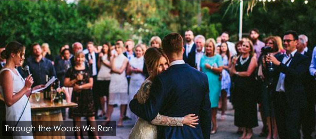
Through the Woods We Ran